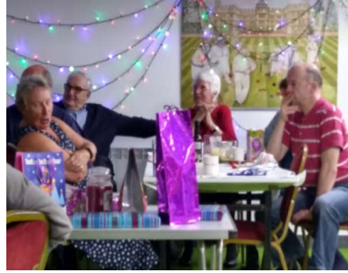
Keep your eye on that prize!