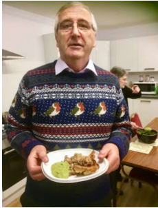
Please sir can I have some more?

Many thanks to all the organisers (prior, during and after).